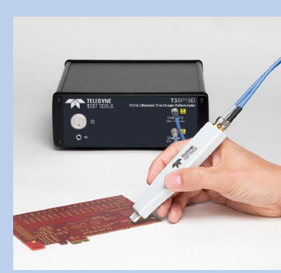
Based on the true differential design, there is no need for a physical ground connection if differential lanes are measured